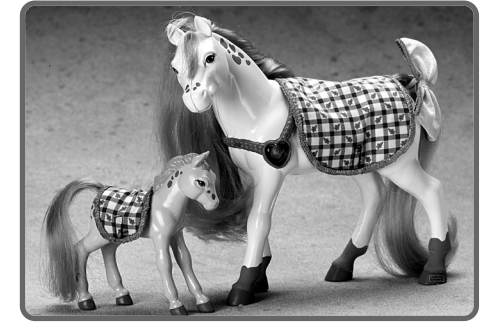
Summer & Baby Sky 75396

Product features and decorations may vary from the pictures above.